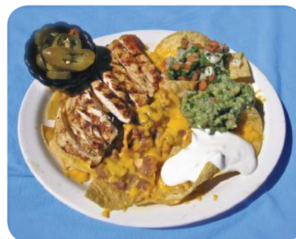
Grilled Chicken Nachos