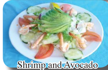
Shrimp and Avocado